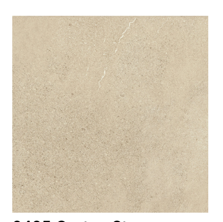
2425 Curton Stone