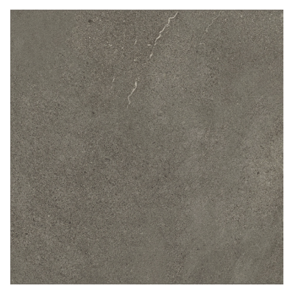
2421 Curton Charcoal