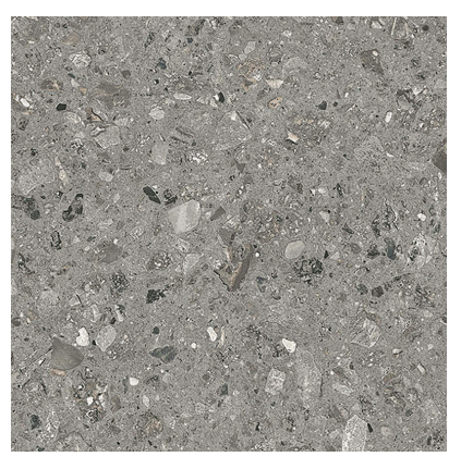
2428 Aquitaine Bister