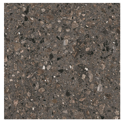
2424 Aquitaine Ash