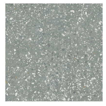
2426 Granito Smoke