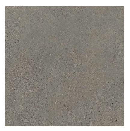
2423 Concrete Grey