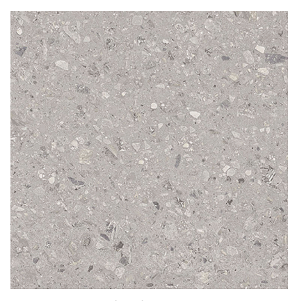
2427 Aquitaine Pearl